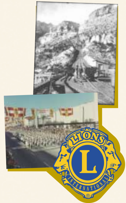
Exhibit designers will be giving tours of exhibits.